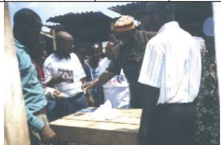
Testing the iodine content of salt at a Bata

pupil was instructed to announce publicly the colour change. If the salt changed colour, the pupil would announce: