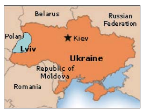
The Lviv oblast in western Ukraine

UNICEF is committed to supporting national efforts on IDD elimination in Ukraine. These efforts include high-level advocacy for adoption of a USI law, and communication to the public on the benefit of iodized salt. A recent pilot program in one oblast (an administrative territorial division within Ukraine, see map) was developed to generate evidence and contribute to national policy development and advocacy in support of USI. The oblast of Lviv was selected for the pilot study in 2004.