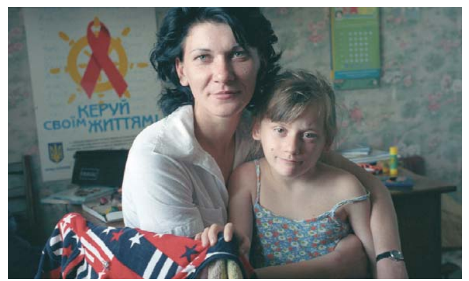
Women and children in Ukraine are particularly vulnerable to IDD

Ukraine has a population of 47 million, 8.8 million of which are children. Iodine deficiency disorders (IDD) are a major public health problem in the country. With the assistance of UNICEF and the U.S. Centers for Disease Control and Prevention (1), a 2002 national assessment found iodine deficiency was prevalent nationwide. In some regions in Western Ukraine, one child in five is goitrous due to lack of dietary iodine. Despite the clear evidence of iodine deficiency nationwide and the international experience with universal salt iodization (USI), the government of Ukraine is