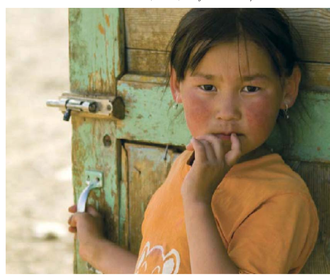
lodination of irrigation water can provide iodine to rural Mongolian children

In 2002, the Inner Mongolia Center for Endemic Diseases Prevention and Control began a similar project, with the additional feature that total soil iodine, in addition to soluble iodine, was measured in order to better define the fate of iodate added to the soil. Potassium iodate was applied in two townships, Nalinxili and Holosumu, in Yijinholo county of the