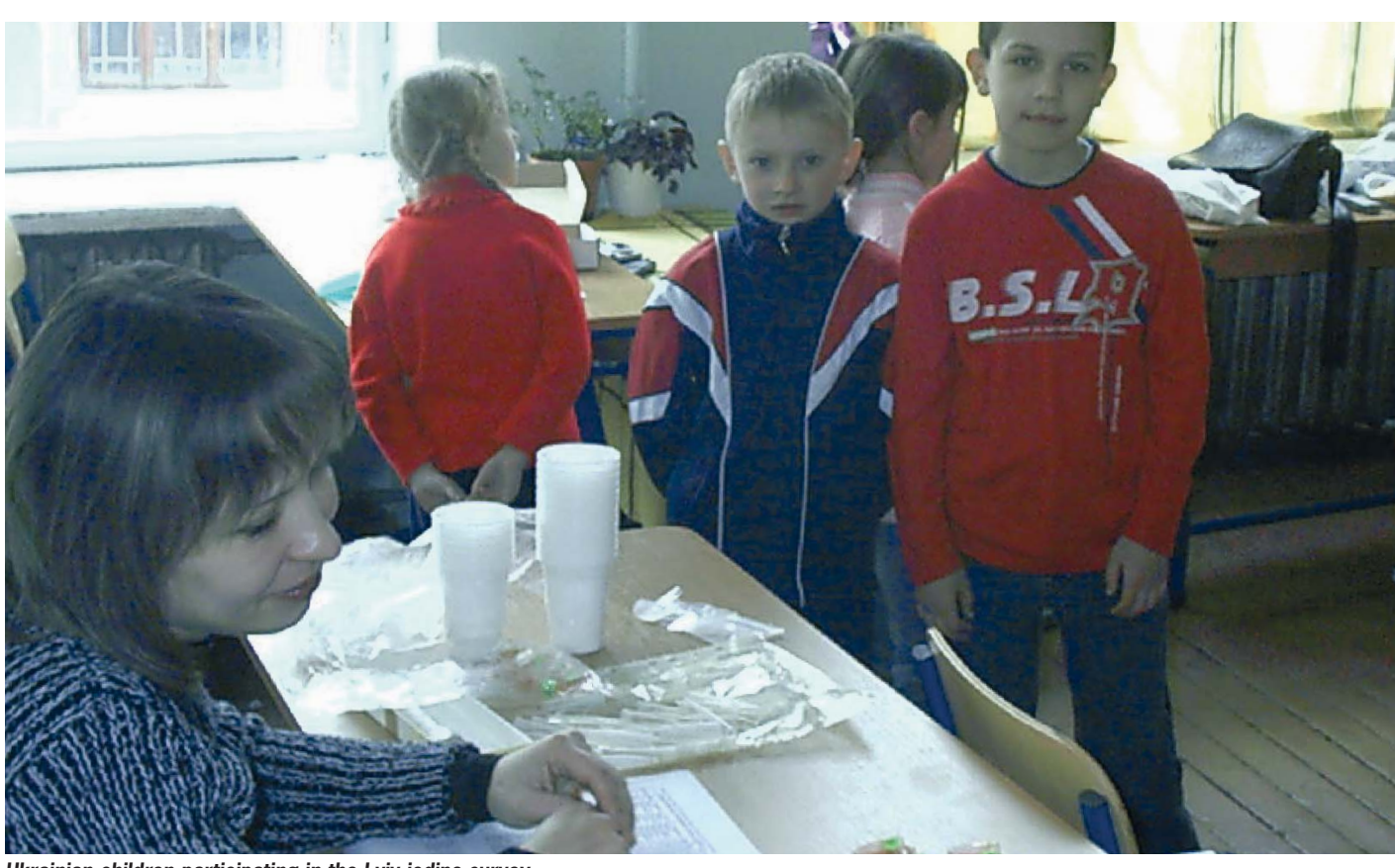
Ukrainian children participating in the Lviv iodine survey

The survey found a median (range) UIC of 144 (2-507) μg/L in the children, within the recommended range indicating adequate iodine intake (2). Only 12.3% of samples had a value <50 \mu g/L and 32.5% <100 µg/L. Fifty-nine percent were in the recommended range of 100 to 299 \mu g/L, and 8.9% were >300 μg/L, suggesting greater than recommended intakes. The field testing of salt samples for iodine found 65% were fortified with iodine. Only 8.2% of the schoolchildren surveyed reported use of iodine containing supplements. Compared to the Ukrainian national median UIC of 90 µg/L, indicating mild IDD, the increased use of iodized salt in Lviv has improved iodine intake among school-aged children. Although the goiter rate was still elevated at 22% in the second year of implementation of the project, the goiter rate is an