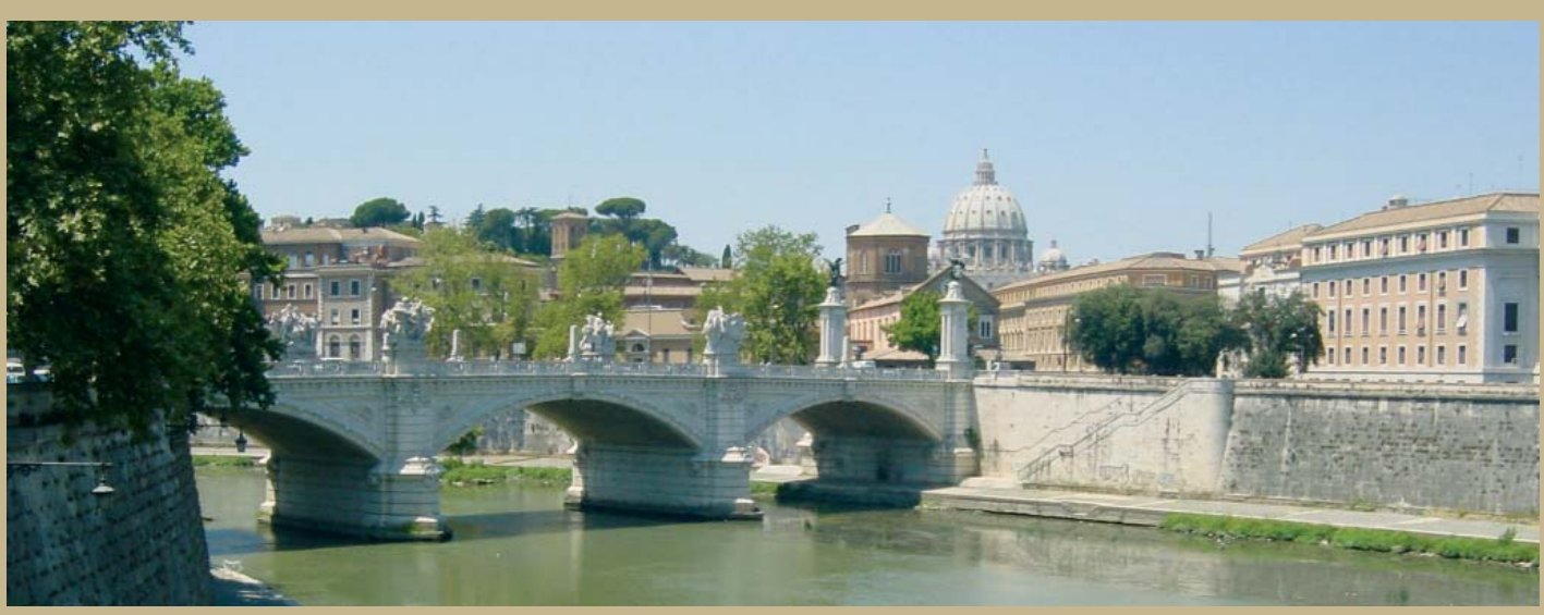
The Italian Parliament in Rome has established a new national IDD monitoring program